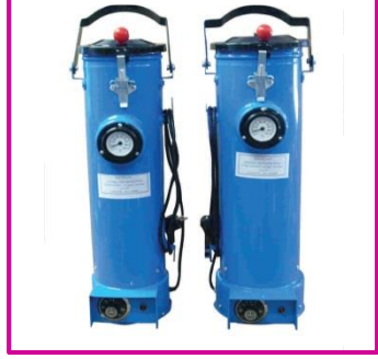
MILD Steel EOB-5-RM EOB-10-RM STAINLESS EOB-5-RS EOB-10-RS EOB-5-RM-MT & EOB-10-RM-MT MAGNET Type / Mild Steel EOC-5-RM & EOC-10-RM – - Inner Body of Mild Steel