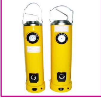
EO-TC-5T & EO-TC-10T Temperature Control / Gauge